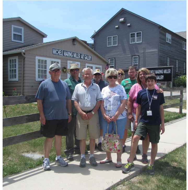
A visit to the Amanna Colonies.