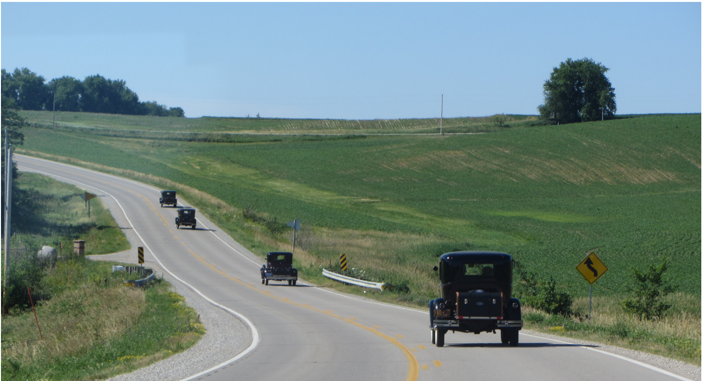
The Rumble Sheet - 11 - July, 2012