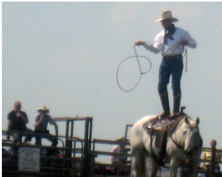
The Rumble Sheet - 2