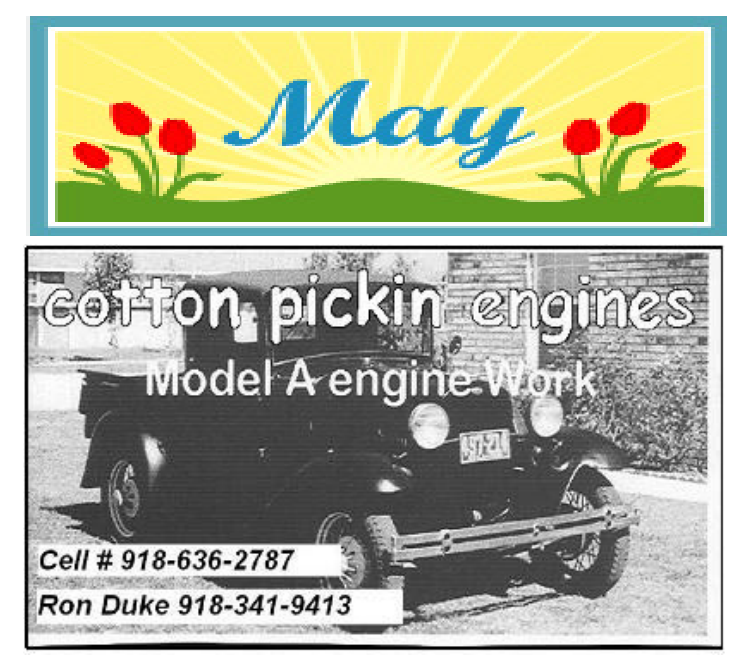
The Rumble Sheet - 7 - May, 2012