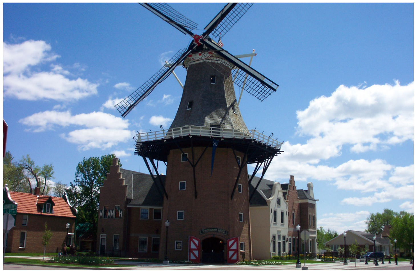
A number of our Tulsa MAFC members are planning to attend this year's Regional Model A Meeting scheduled June 11-15 in Altoona, Iowa. While early registration closed May 1, late registration is still available.