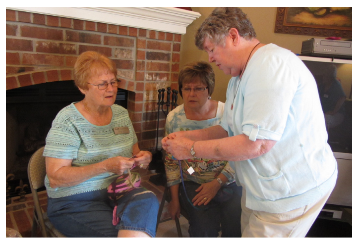
The Rumble Sheet - 10 - May, 2012

618 West 11th Avenue Bristow, OK 74010 (H) 918-367-6410 (c) 918-607-4285 beabil153@aol.com William September 6 Geraldine June 27 Anniversary June 2 1929 Tudor