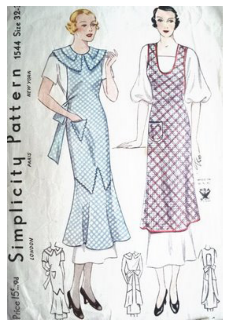
Aprons have become a collectible and fashionable item again. You might want to add a vintage 1930s-look apron to your collection. Even reproduction fabrics are now available on Internet sites. Pictured are two patterns published by Simplicity in the 1930s