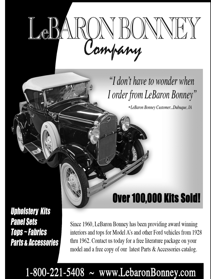
6 Chestnut St., Amesbury, MA 01913