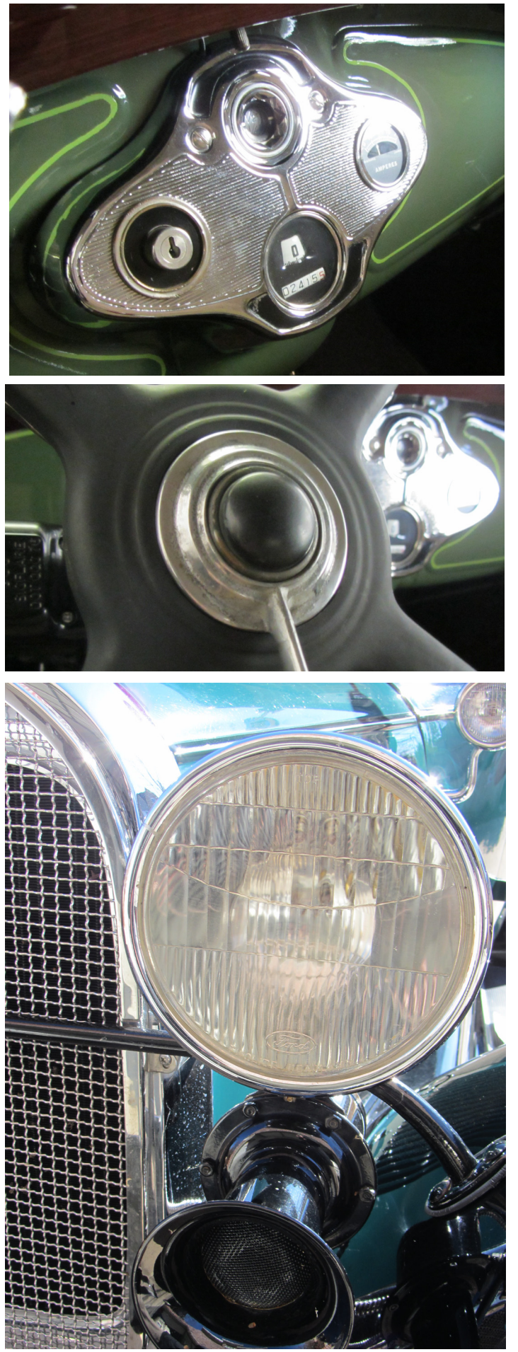
The Rumble Sheet - 9 - January, 2012