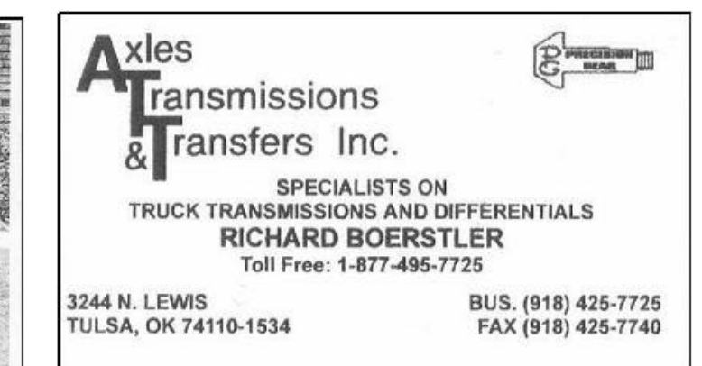
The Rumble Sheet - 3 - August, 2011