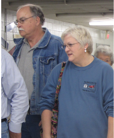
Disclaimer: Pictures of Model A Members are actually from the potato bake but admiring looks may have applied at the Tulsa Auto Show.