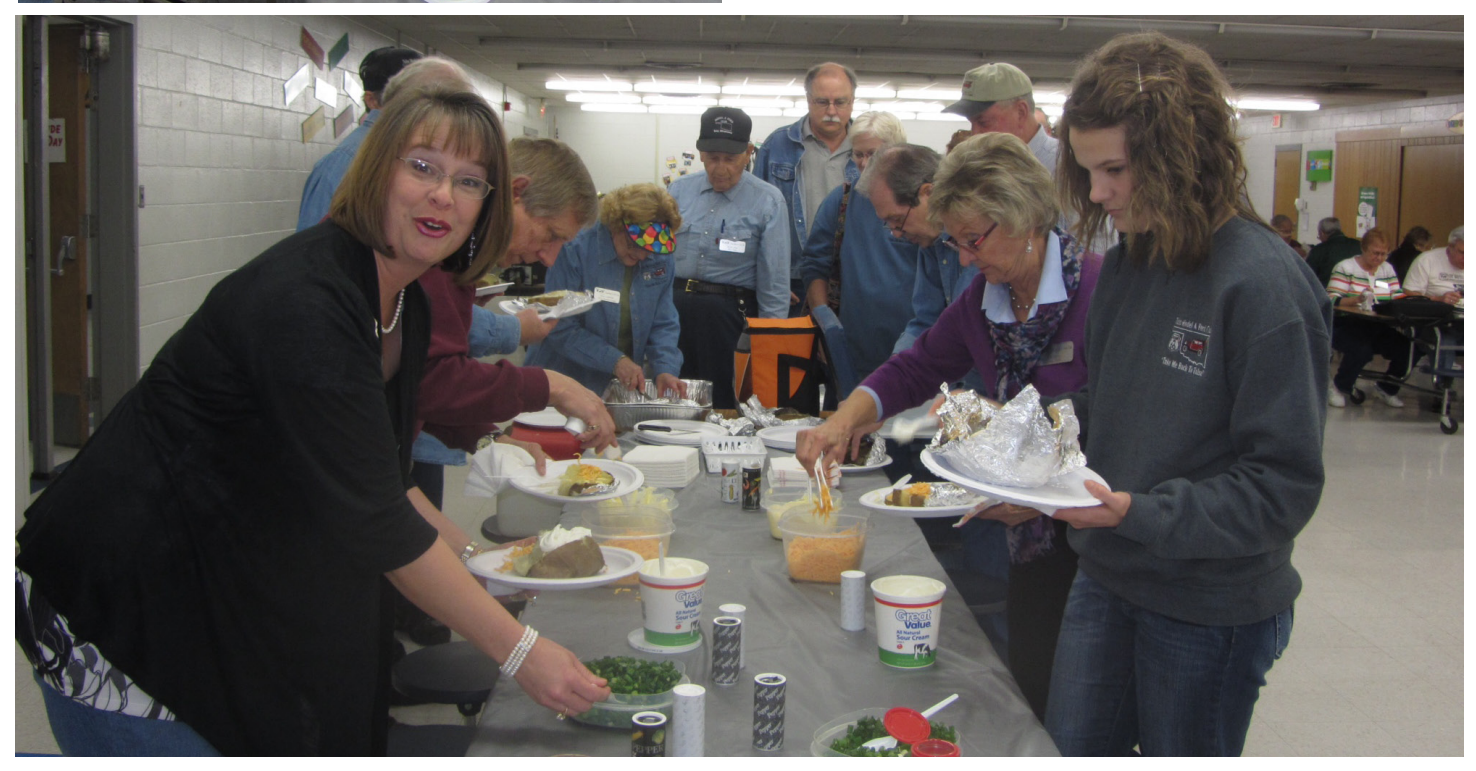
The Rumble Sheet - 3 - April, 2012

If more information is needed, call Jerry Conrad at 918-749-3730 or Marvin Mellage at 918-633-4875. We hope to see all of you soon.