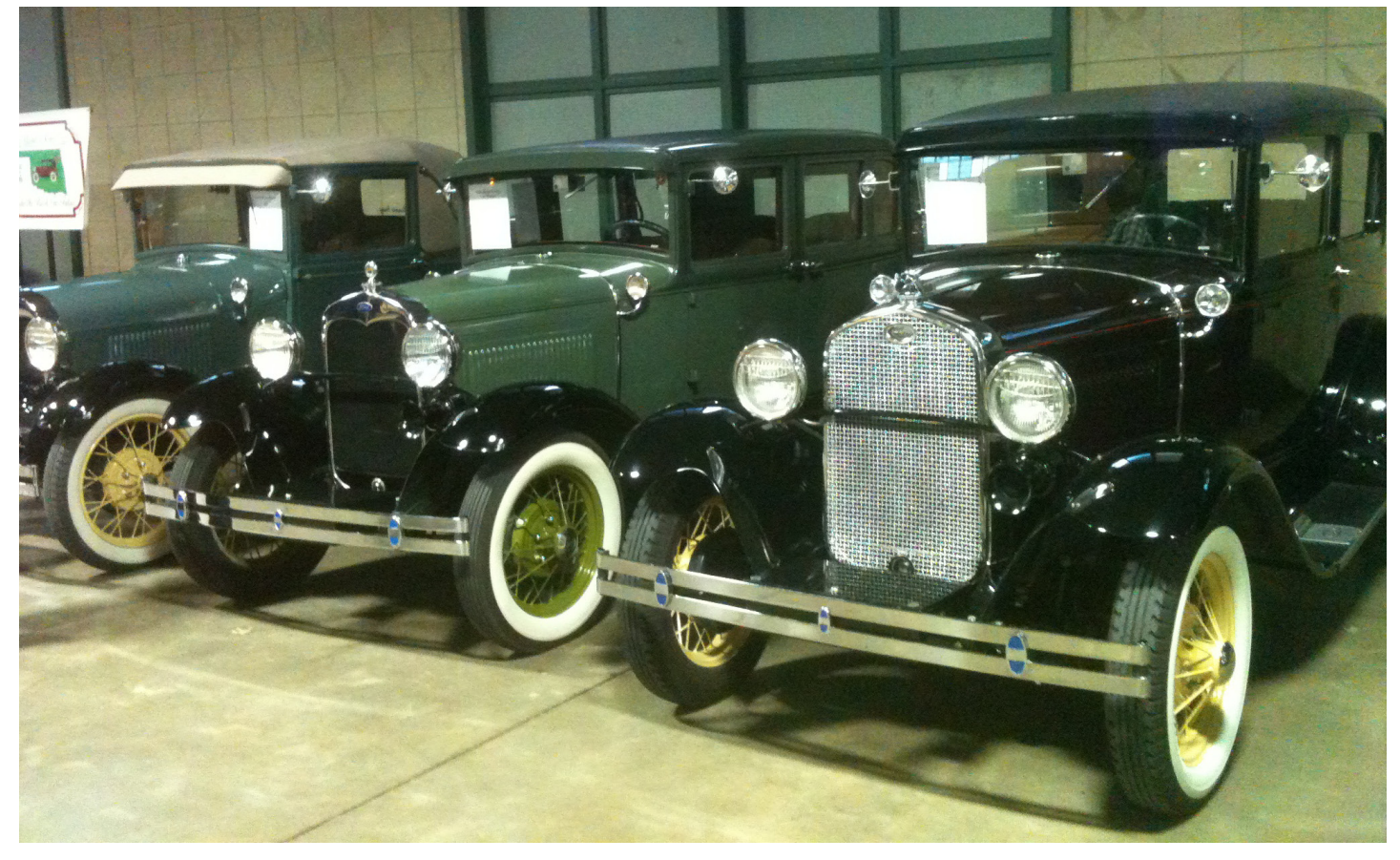
The Rumble Sheet - 9 - April, 2012