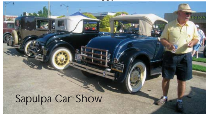
Sapulpa Car Show